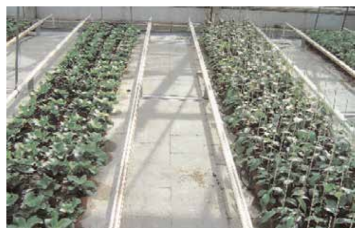
Shadows with clear covering